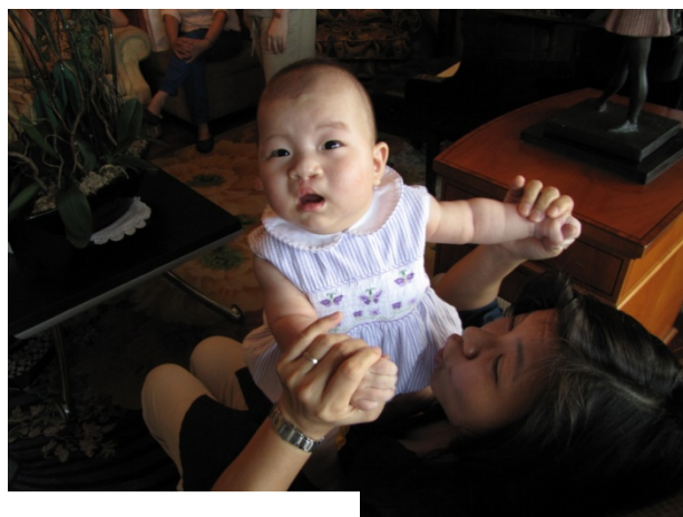
AFTER THE SURGERY