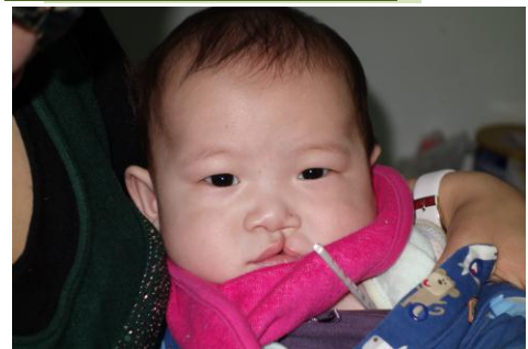
After the Surgery